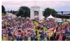
Annual Events & Exhibits