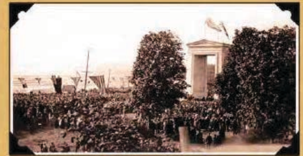
Peace Arch Dedication, September 6, 1921

Two bronze plaques are placed above the exterior foot walls of the Arch. One is of the Canadian steamship the Beaver;